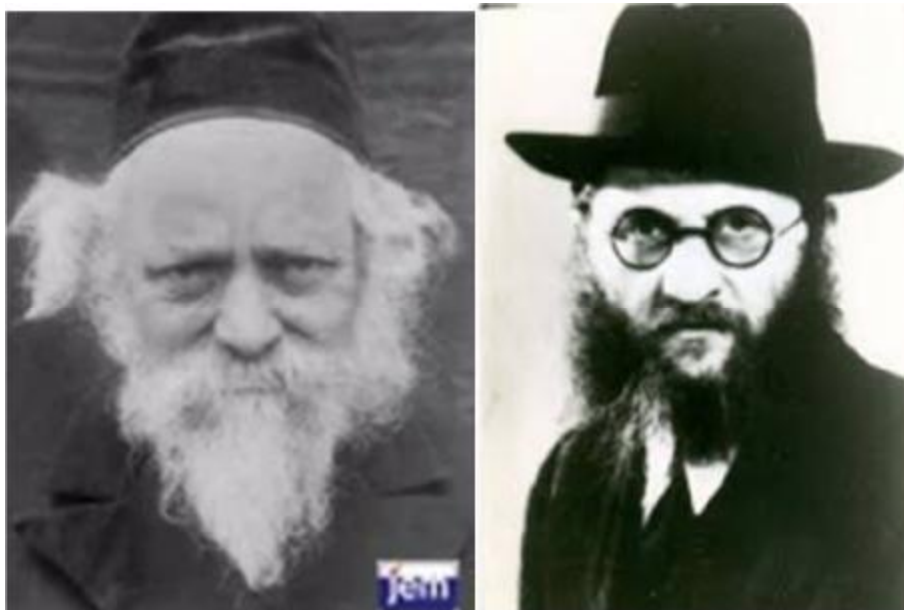
Rav Boruch Ber Leibowitz and Rabbi Reuven Grozovsky

In 1929, R’ Boruch Ber Leibowitz, the Rosh Yeshivah of the Kamenitzer Yeshivah in Poland, and his son-in-law, R’ Reuven Grozovsky, came to America to raise funds for their yeshivah. Among the cities they were to visit was Baltimore,