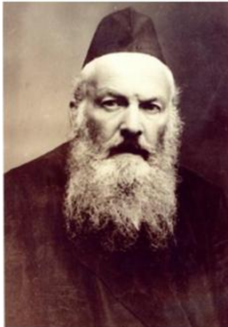
Rav Elchanan Wasserman

As he approached the bakers, he had a special practice to sing for them while he requested their generous donations. When he had a substantial amount of bread, he would return to his home with it, as his house also doubled as the Yeshivah's dining room, and the boys would eat their breakfast there.